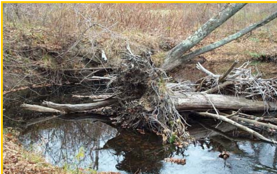
Example of various types of large woody debris in the Moosup River, Plainfield.

Trees that grow along a streamside can often fall into a watercourse due to floods, erosion, windthrow, disease, beaver activity or natural mortality. These materials, often referred to as Large Woody Debris (LWD) can include whole trees with a rootwad and limbs attached or portions of trees with or without rootwads or limbs. LWD is typically defined by biologists as logs with a minimum diameter of 4 inches and a minimum length of 6 feet that protrude or lay within a stream channel. Environmental and recreational groups have often removed LWD as part of river cleanup or river improvement projects. Although these groups have good intentions, LWD removal can be “very detrimental” to stream health and well being. In fact, during the last decade, the Inland Fisheries Division has been actively adding LWD to river systems as a component of individual stream restoration projects, particularly in streams that are LWD deficient. This fact sheet describes the vital importance of LWD to river ecosystems and provides guidance for its beneficial management.