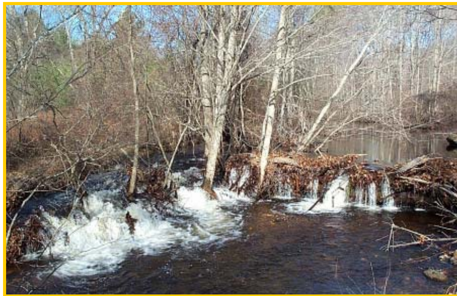
Example of a newly formed logjam in the Fenton River, Mansfield.

Logjams are natural accumulations of LWD that may span an entire width of stream channel and create a partial obstruction to streamflows. Logjams usually do not block upstream fish passage. In some circumstances where streams are completely blocked, logjams can create a backwater condition and flood riparian lands providing beneficial nutrient enrichment to riparian soils. Logjams provide many of the same benefits of LWD that have been described elsewhere in this fact sheet; however, another important function is that logjams may redirect streamflows resulting in the formation of a new stream channel or perhaps even redirect flow into an abandoned channel. These channel shifts are normal occurrences and function to effectively move water and sediment loads throughout a stream system.